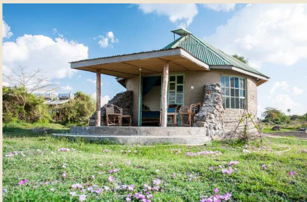
Hotelini 1 & 2

Create the Volunteer Village. In 2018, for example, the children's villa had the motto "Home is where you feel good," organized by Volunteers. Other volunteers took care of waste disposal in Momella or collected plastic waste lying around with the children.