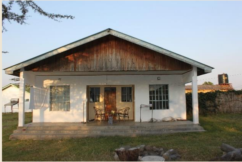
Helper House 1 & 2