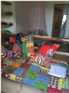
Pamoja Room 1 & 2