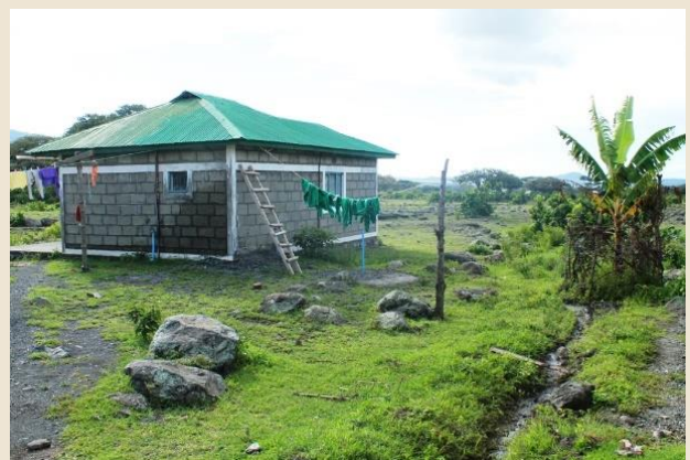
KinderVilla 1 & 2